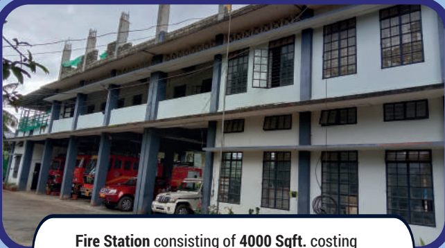
Fire Station consisting of 4000 Sqft. costing Rs. 50 Lakhs at Kalpetta 2021