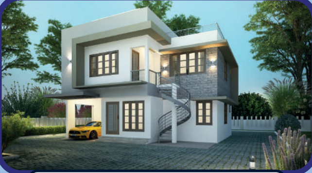
Residential Building consisting of 2000 Sqft. costing Rs.75 Lakhs at Mullur. (Thomson) 2020