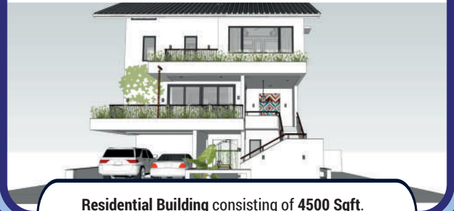
Residential Building consisting of 4500 Sqft. costing Rs.2 Crores at Carmelaram. (Felix) 2022