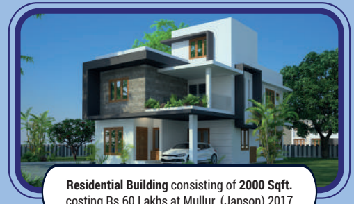
Residential Building consisting of 2000 Sqft. costing Rs.60 Lakhs at Mullur. (Janson) 2017