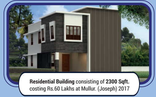
Residential Building consisting of 2300 Sqft. costing Rs.60 Lakhs at Mullur. (Joseph) 2017