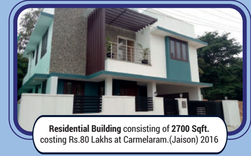
Residential Building consisting of 2700 Sqft. costing Rs.80 Lakhs at Carmelaram.(Jaison) 2016