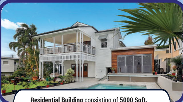
Residential Building consisting of 5000 Sqft. costing Rs.1.5 Crore at Carmelaram. (George) 2021