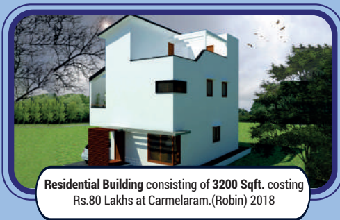
Residential Building consisting of 3200 Sqft. costing Rs.80 Lakhs at Carmelaram.(Robin) 2018