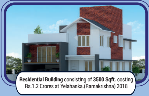
Residential Building consisting of 3500 Sqft. costing Rs.1.2 Crores at Yelahanka.(Ramakrishna) 2018