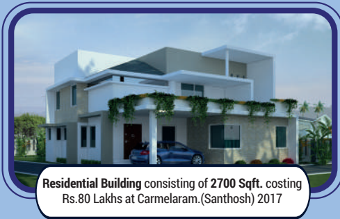
Residential Building consisting of 2700 Sqft. costing Rs.80 Lakhs at Carmelaram.(Santhosh) 2017