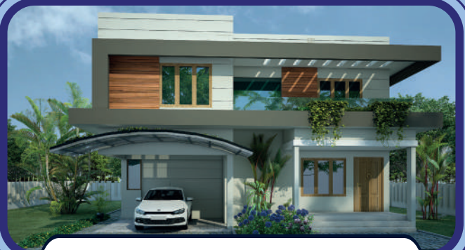
Residential Building consisting of 3200 Sqft. costing Rs.1.2 Crores at Carmelaram.(Wijo) 2018