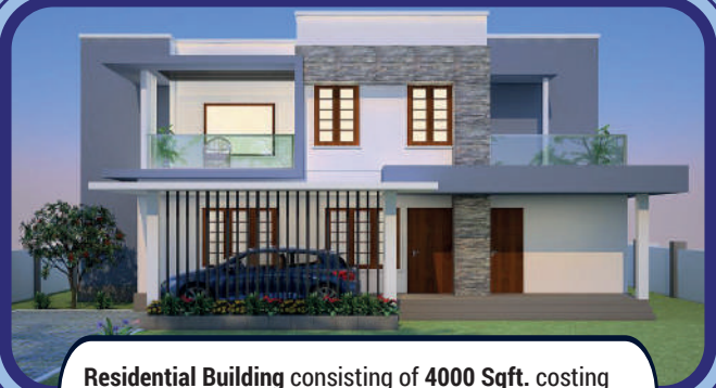
Residential Building consisting of 4000 Sqft. costing Rs.1.5 Crore at Carmelaram. (Joseph K.J) Kalpetta 2021