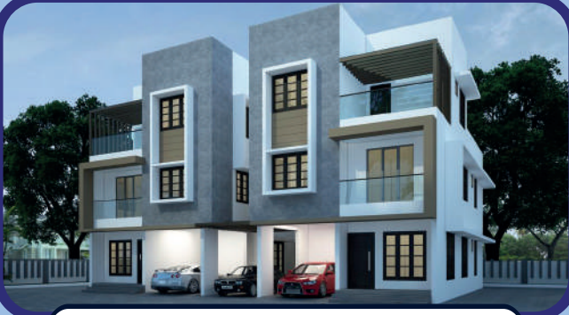
Residential Building consisting of 2500 Sqft. costing Rs.80 Lakhs at Carmelaram.(Manoj) 2020