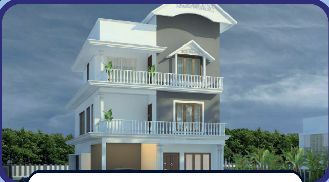
Residential Building consisting of 3000 Sqft. costing Rs.1 Crore at Electronic City.(Saji) 2019