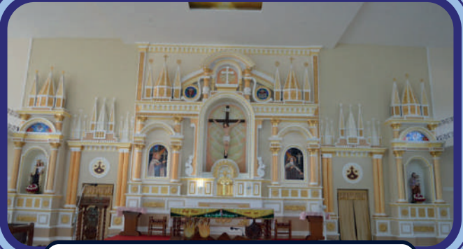
C.T.C Church Renovation 50 Lakhs Carmelaram