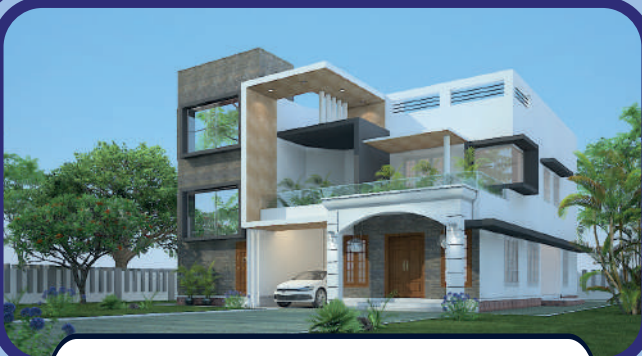
Residential Building consisting of 4000 Sqft. costing Rs.1.4 Crores at Carmelaram.(Sebastian) 2019