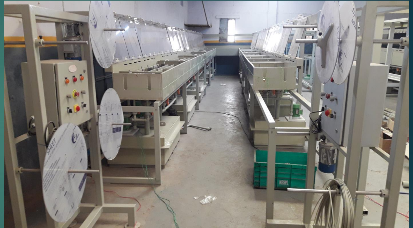
Barrel Plating and Reel to Reel Plating Plant Installation