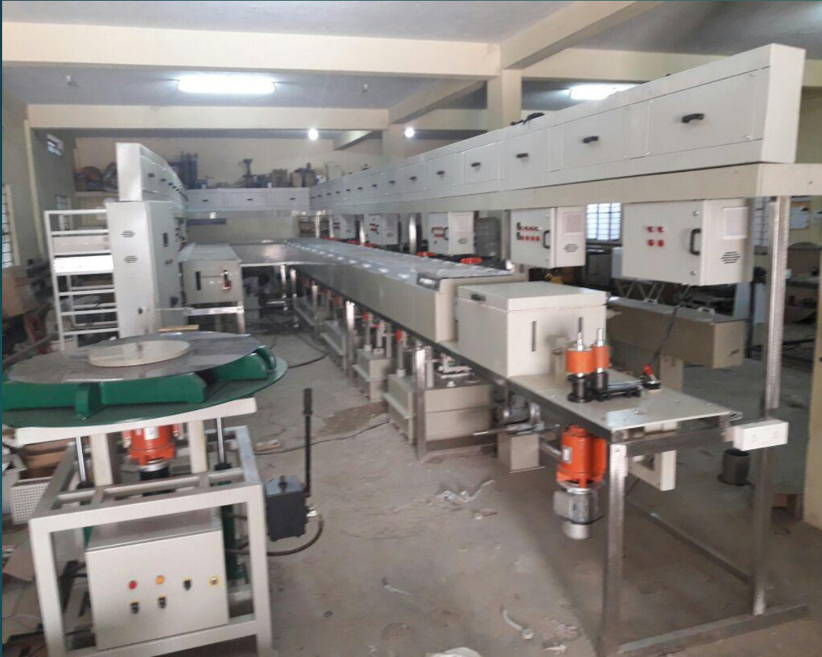
Reel to Reel Plating plant