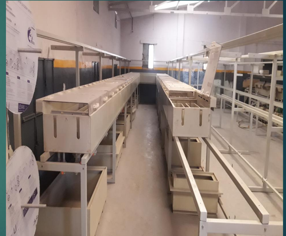
Reel to Reel Plating Plant Installation