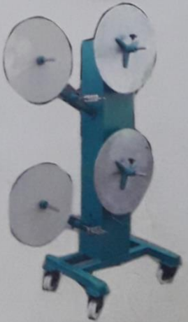
VERTICAL - WINDER