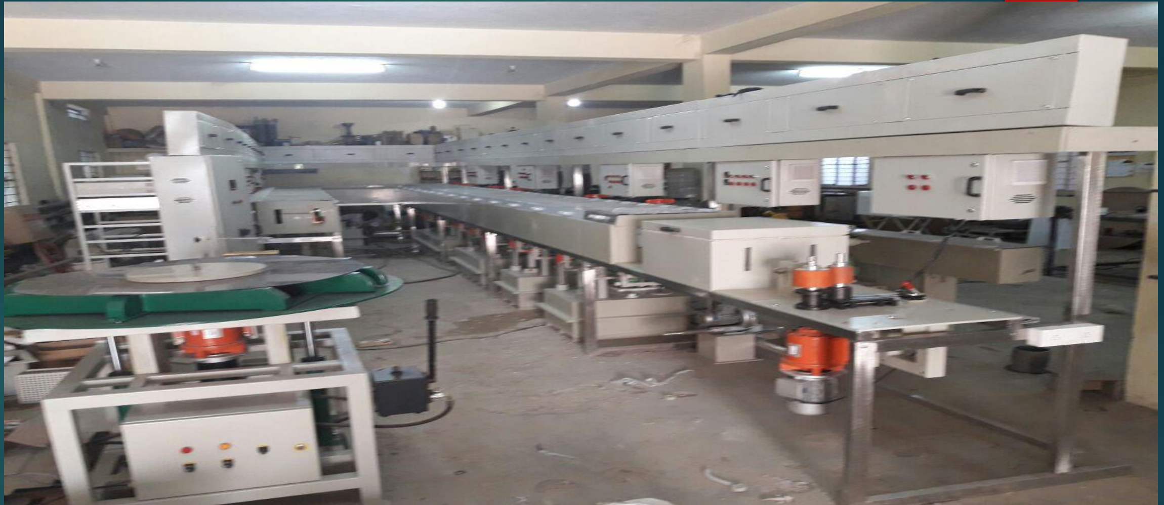
Two Strip Reel to Reel Plating Plant