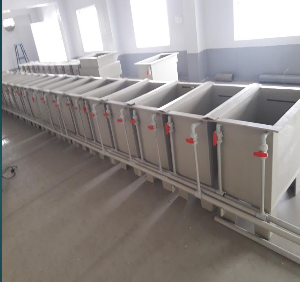
Barrel Plating Installation