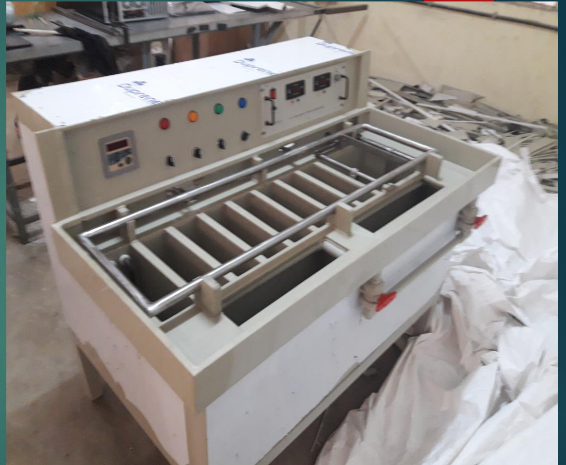
Rack Plating Installation