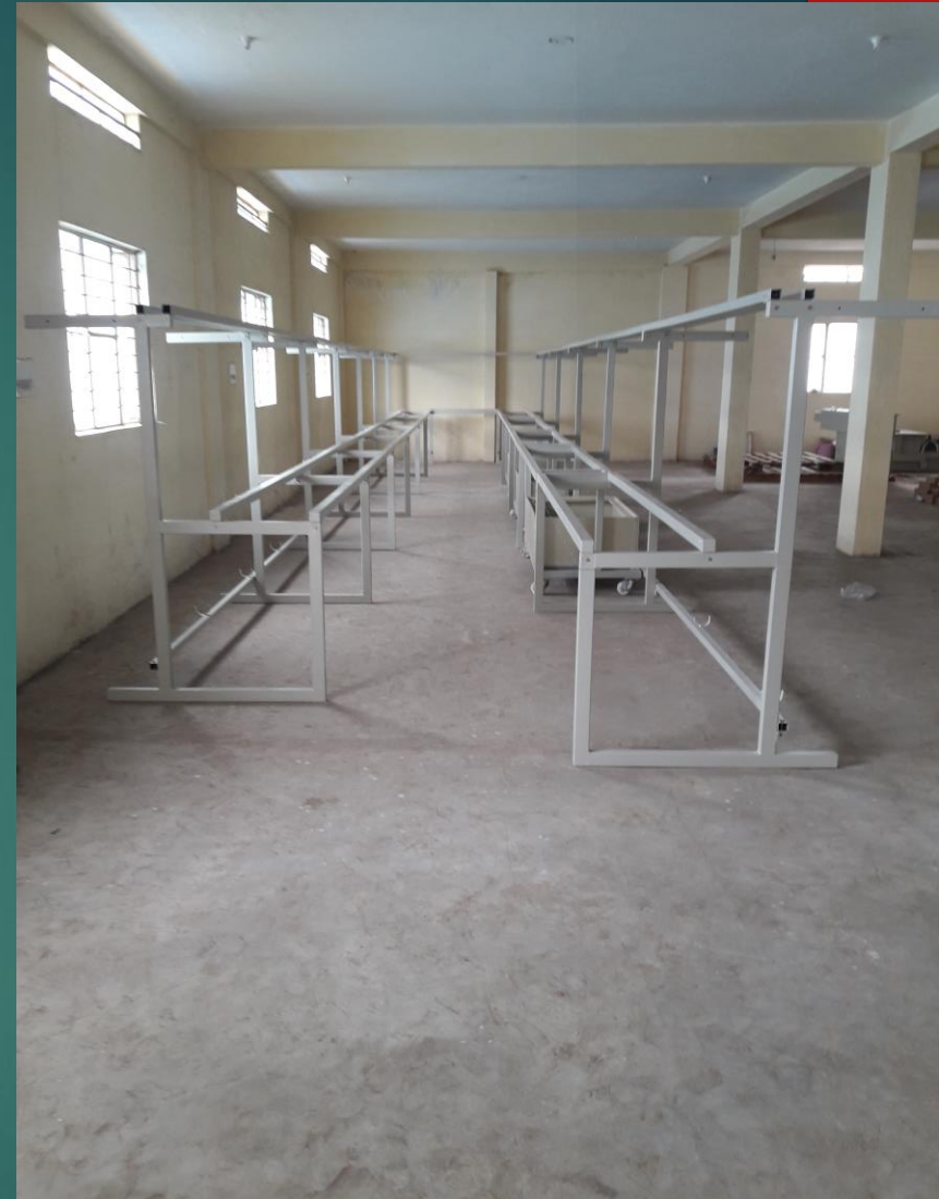
Plating plant Structure Work