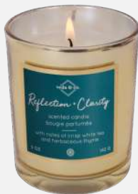
VC104 REFLECTION & CLARITY