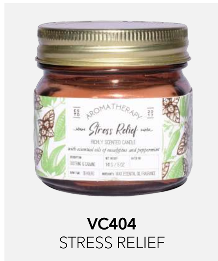
VC404 STRESS RELIEF