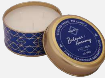
VC202 BALANCE & HARMONY