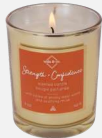
VC103 STRENGTH & CONFIDENCE