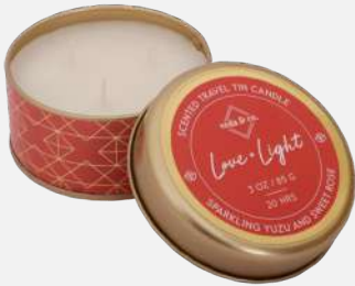
VC201 LOVE & LIGHT

3 OZ / 85 G | 1.6" H X 2.9" D | 18 HOURS