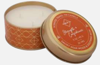
VC203 STRENGTH & CONFIDENCE