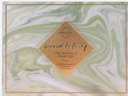
VCB02 * CUSTOMIZABLE PRODUCT SELECTION AVAILABLE