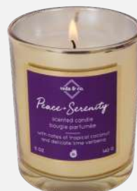
VC105 PEACE & SERENITY