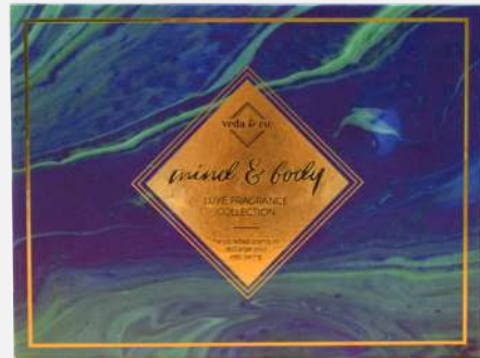
VCB01 ASSORTED FRAGRANCES

TWO GILDED GLASS CANDLES | TWO TRAVEL TIN CANDLES | LINEN SPRAY