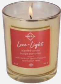
VC101 LOVE & LIGHT

5 OZ / 142 G | 3.3" H X 2.7" D | 32 HOURS