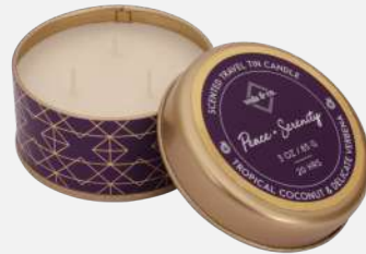
VC205 PEACE & SERENITY