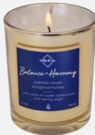
VC102 BALANCE & HARMONY