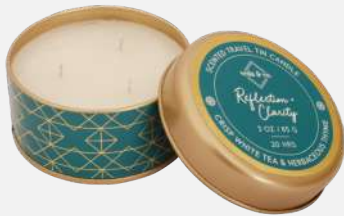
VC204 REFLECTION & CLARITY